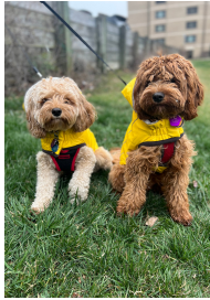
August Pets of the month Milo and Arthur spotted rocking matching raincoat outfits around WAL!