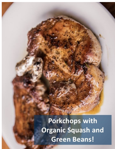
Porkchops with Organic Squash and Green Beans!