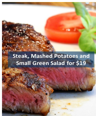
Steak, Mashed Potatoes and Small Green Salad for $19

Buy a class pass to use for any or all fitness classes. Join at any point during the season. Passes purchased for the Winter Exercise Schedule must be used by March 31, 2022.